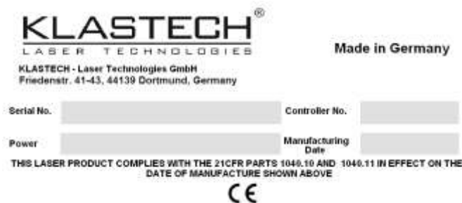
Pic. 1: Sticker located on the laser head and the controller indicating the serial number of the laser and the serial number of the controller.

Note: Laser head and controller are tuned to each other to form a self-compatible set. They are labelled accordingly with reference to the serial number of the respective counterpart. The laser head must not be used with other than the specified controller! Mismatching will probably result in damage of the laser head!